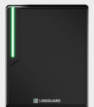
Line Ultra Touch